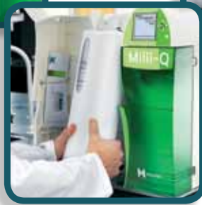
Q-Pak polishing cartridge replacement