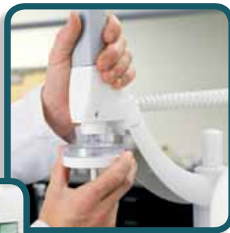
Millipak Express 40 replacement