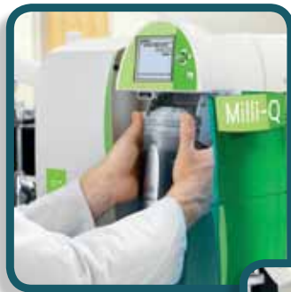
Progard Pack replacement

Maintenance frequency is minimal, and the procedures are simplified.